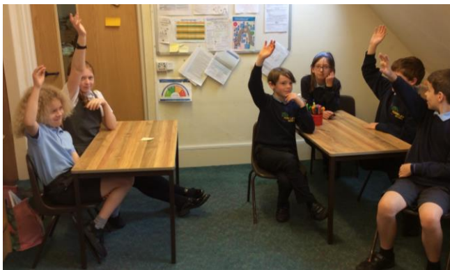
School Council Voting

Three themes were put forward: Class 1 and Staff voted for Forest Flowers, Class 5 wanted Forest Birds, however, Classes 2, 3, and 4 all voted Planets/Space. The next stage was brainstorming words linked to Planets/Space ready for finalising individual class names.