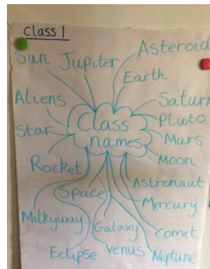
Class 1 ideas