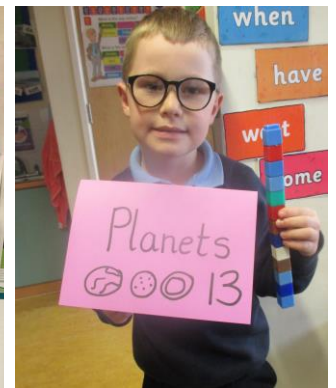
Counting results Class 2